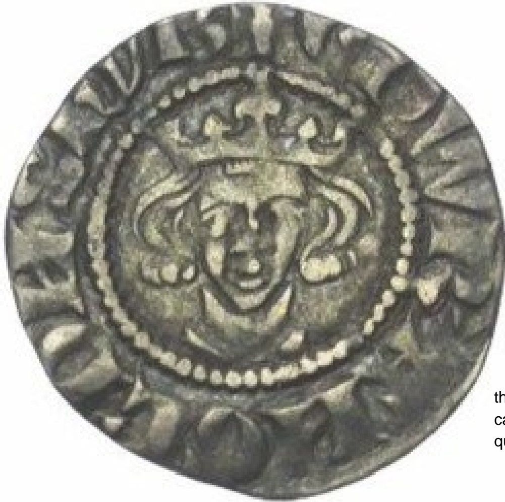
A coin of King Edward 1st

the possibility for clipping can be seen in this quarter